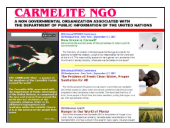
More information about the environment and the Carmelite efforts to confront the problem, as well as other initiates of the Carmelite Family around the world is available online at carmelitengo.org.

The United Nations Environment Program (UNEP) has launched a major worldwide tree planting campaign. Under the Plant for the Planet: Billion Tree Campaign, people, communities, business and industry, civil society organizations and governments are encouraged to enter tree planting pledges online with the objective of planting at least one billion trees worldwide each year.