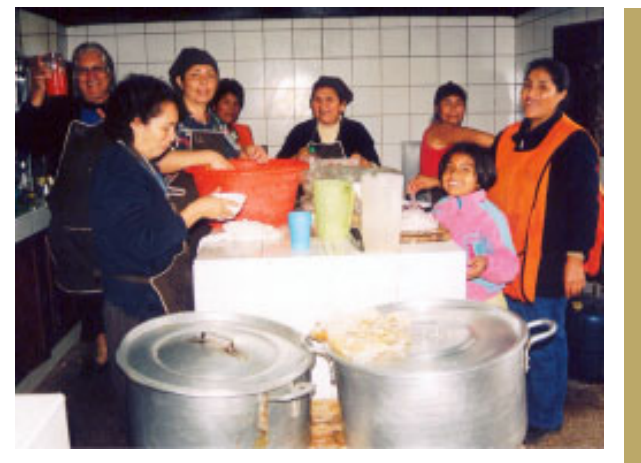
Women prepare food for distribution at Nuestra Señora del Carmen, a comedor popular or a public dining facility, in Arequipa, Perú.

The development taking place in the southern countries will not mimic our own development. The consumption of materials and energy on that scale is unsustainable if implemented worldwide. The south's development will be "green" or it will not happen at all. That is why all of Karit's projects consider the ecological impact. For example, the implantation of Comedores